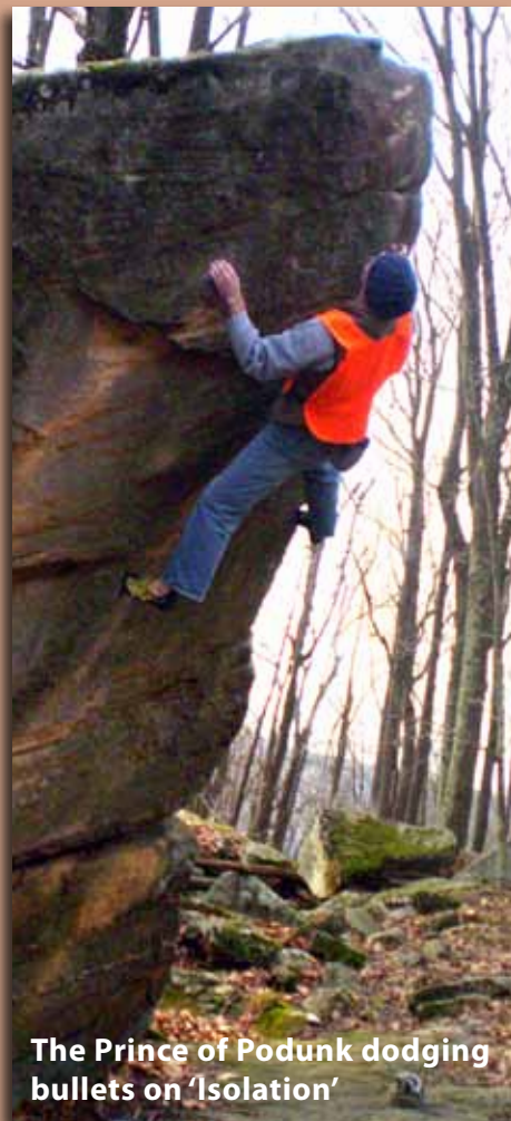
The Prince of Podunk dodging bullets on 'Isolation'

The bullet sandstone of the lower boulders is great, though the aggressive nature of Rimrock gritstone can be daunting. If you have the baby soft skin of a climbing neophyte, or the average once-a-week plastic-pushing-pansy, you will find